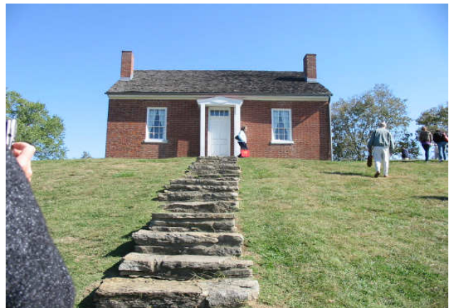
Rankin House Ripley, Ohio