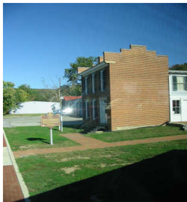
Parker House –side view