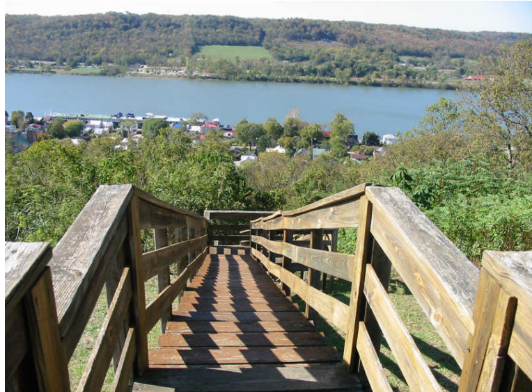
Steps and view of Ohio River from the Rankin House