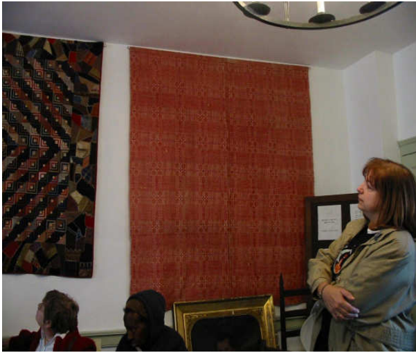
Quilt display at Parker House