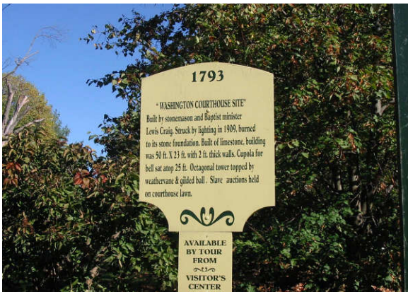
Old Washington, Kentucky